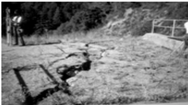
Extensional Crack Oct. 17, 1989