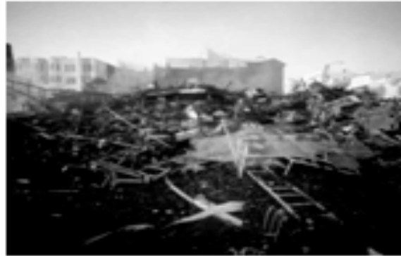
Apartment complex Oct. 17, 1989