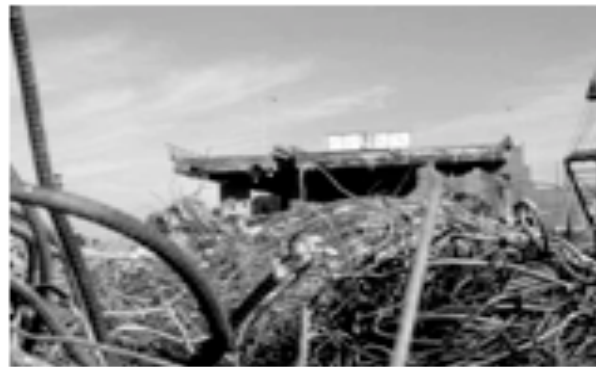
Cypress Viaduct Oct. 19, 1989