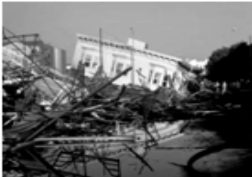
Collapsed building Oct. 19, 1989